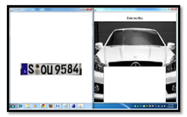
Fig8: License plate and remaining image stored at private and public cloud