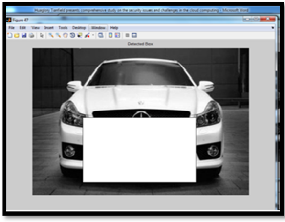
Fig3: Car image without license plate

Finally after extracting all the characters from the image and MATLAB matching all the characters and outliers with the image, the image is displayed without license plate.